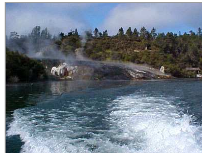
Boating on Lake Ohakuri

This geothermal landscape spoils Rotota members with the luxury of a lakes edge thermal hot-tub - relax Rotota style!