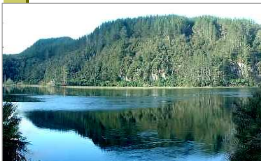
Across Lake Ohakuri