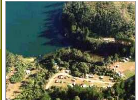
Aerial view of Rotota