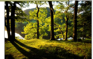
Sunrise over the lake

Our on-site caretaker will happily show all visitors around the grounds